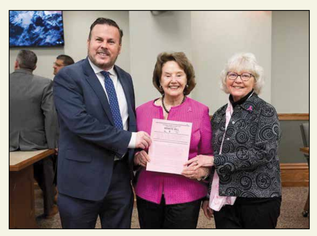
Here I am holding a copy of Senate Bill 8 after voting for it.

As Chairman of the House Insurance Committee, I work with my colleagues to review bills dealing with insurance issues of all kinds in the state.